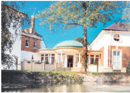
TAKE STOCK: Greenwood's relaxing spa

This signature treatment uses Thai, Swedish and aromatherapy techniques and is aimed at relaxing rather than reviving. My other half